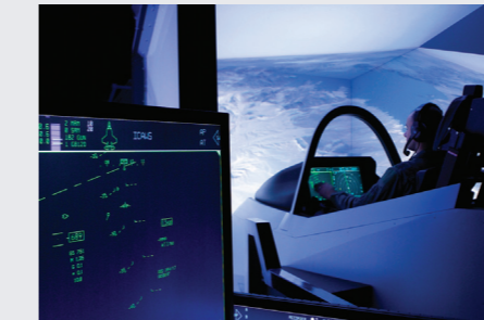
Sector 6 - Tangier