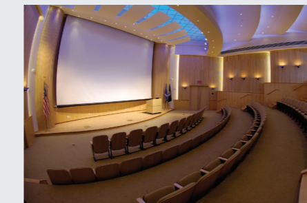
Sector 2 - Thimble Shoal Auditorium