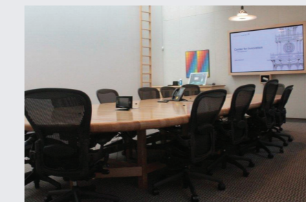
Cape Lookout and Cape Henry Conference Rooms