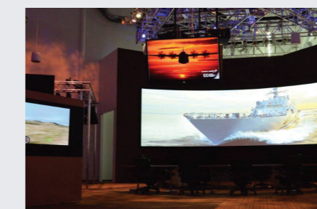
Sector 5 - Chincoteague