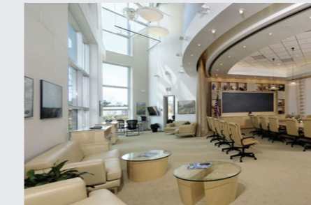
Sector 1 - Cape Hatteras Conference Room